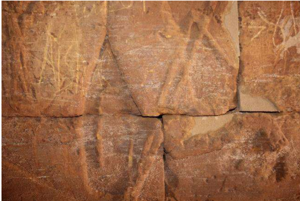
Wet Sandstone Blocks and Presence of Salt in Beg. N. 12.

The collapses of sandstone chunks from the top of some of the pyramids indicate the most severe effect of the intense rain and the irresponsible attitude of the visitors.