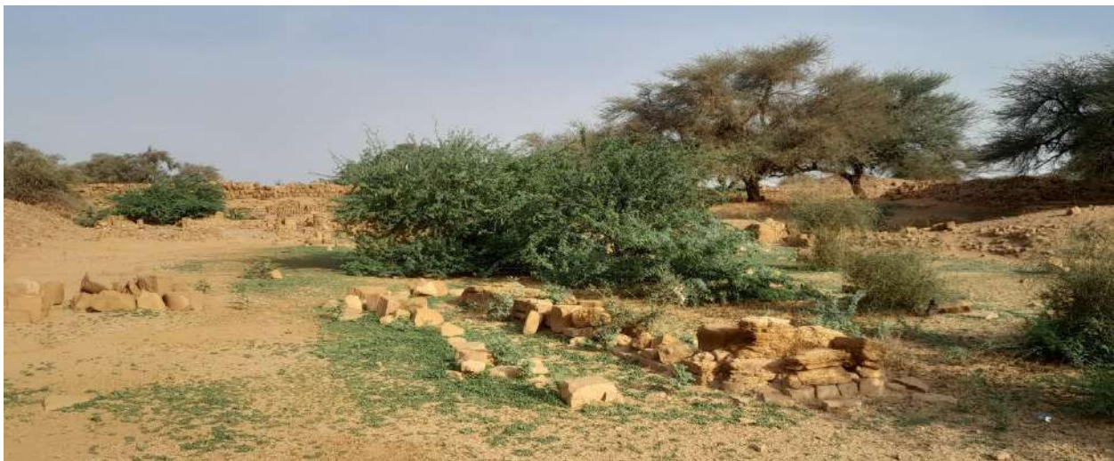
Amun Temple Condition (February 2024)

Natural elements, such as rain, have also adversely affected the conservation of the site. The rain has led to the growth of trees throughout the site and its monuments. A major issue is the absence of drainage systems in Meroe Royal City, which poses a direct threat to the monuments and contributes to the uncontrolled proliferation of vegetation.