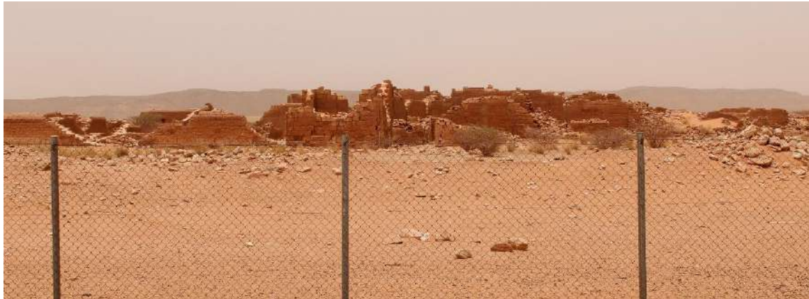
Musawwarat monument condition (February 2024)