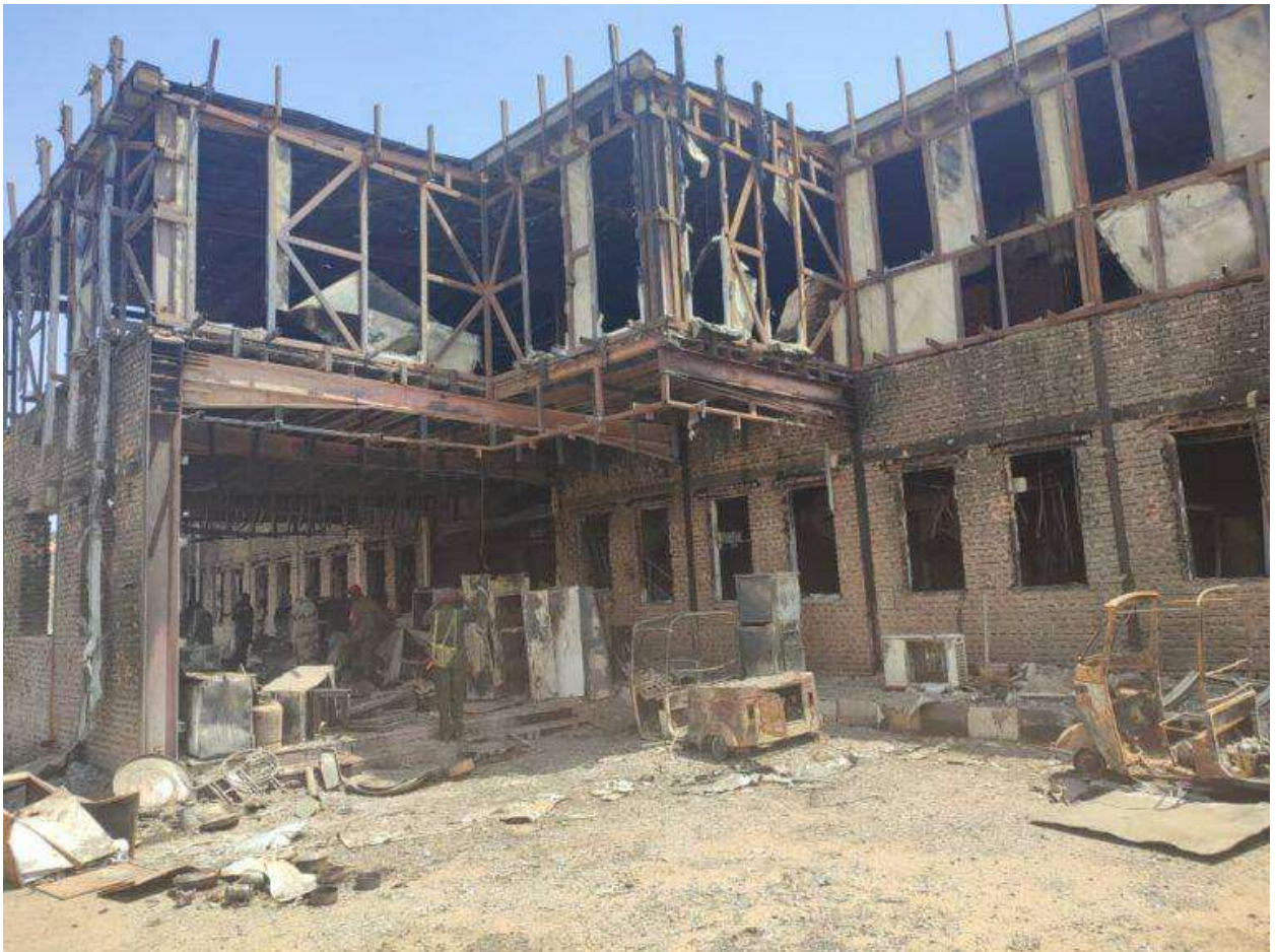
Omdurman Radio, published by Noor News