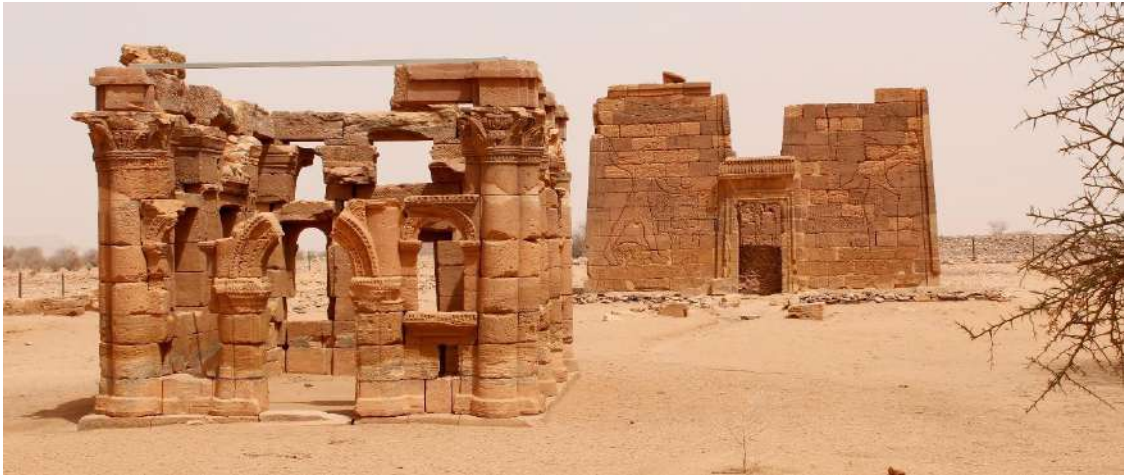
Condition of Naqa Monuments (February 2024)

the site at Musawwarat and now both are surrounded by landmines and there are several military camps around the area.