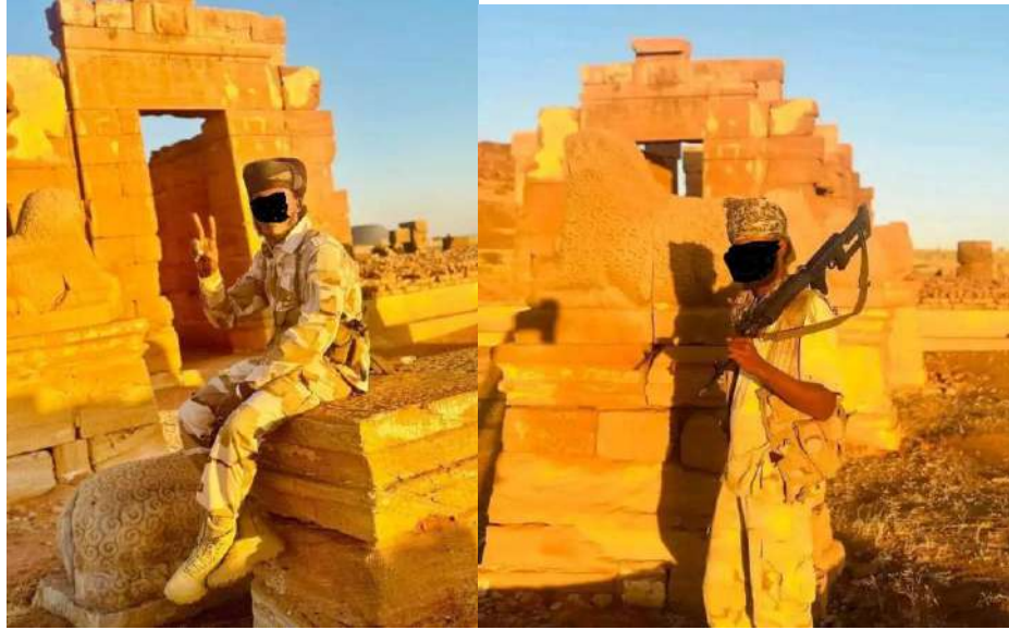
Appearance of Armed Forces at Naqa in January 2024